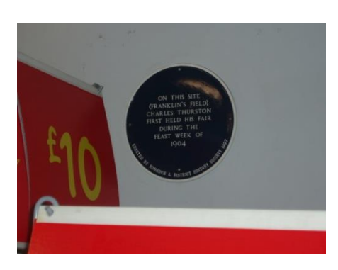
was built on the site.

Victorian building known as Stonehurst is on the wall of the empty premises that were occupied by B M W Windows. In WW1 Stonehurst was used to house Belgian refugees and in WW2 was bomb damaged on the same day as Alfred Street School.